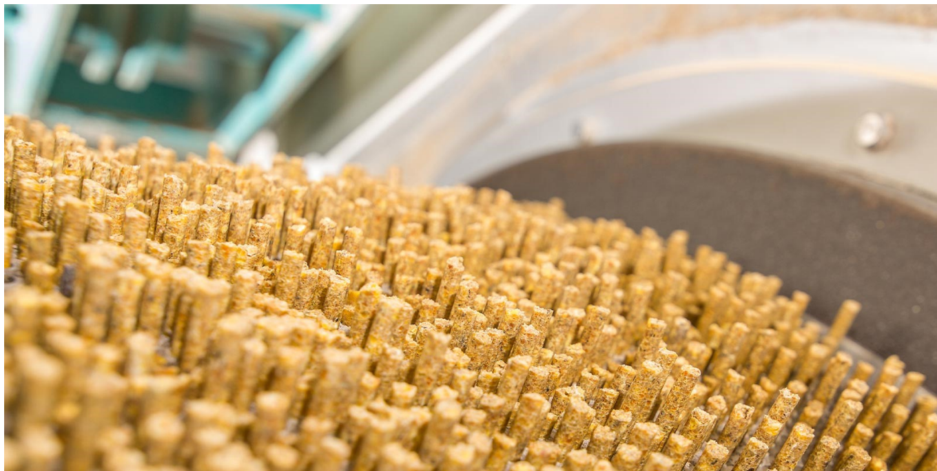
Feed mills are critical sites for biosecurity measures in poultry production

A physical barrier or sign indicating a biosecurity area on a farm or building entrance can help remind people of the program. Of course, these signs will not stop a disease from entering, nor a person determined to enter a site, but they will cause well-trained people to pause and reflect if they are making a sound decision.