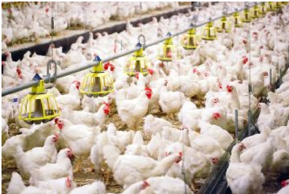
Relatively high stocking density is the norm in poultry production

The build-up of mucus in the respiratory tract severely reduces oxygen intake, causing breathlessness, reduced feed intake, and a drop in the birds' energy levels, which negatively impacts weight gain and egg production. Respiratory problems can result from infection with bacteria, viruses, and fungi, or exposure to allergens. The resultant irritation and inflammation of the respiratory tract leads to sneezing, wheezing, and coughing – and, therefore, the infection rapidly spreads within the flock.