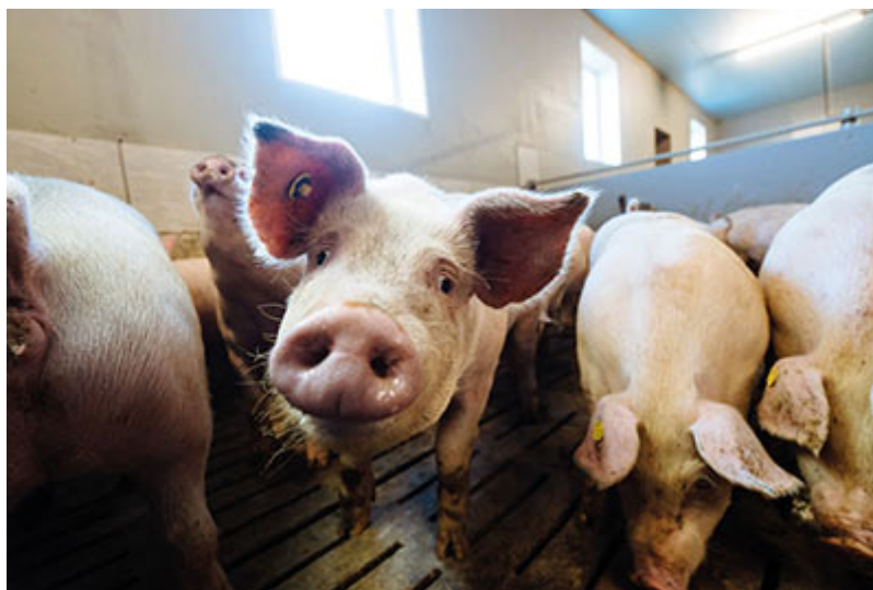
Pigs are susceptible to antinutritional factors

When by-products are fed to pigs, swine nutritionists have reported that many of them can support pig growth and finishing performance and meat quality as well as immune response, milk yield, and milk quality in reproductive animals, among other productive parameters (Yang et al., 2021). For instance, Dong et al. (2019) concluded that, from a nutritional perspective, ingredients such as highland barley, buckwheat, glutinous broomcorn millet, non-glutinous broomcorn millet, and Chinese naked oat could potentially substitute corn in livestock feeding. Or as another example, Liu et al. (2019) suggest in their study that mulberry leaf can contribute to improvements in meat quality, with no adverse effects on the growth performance of finishing pigs. (Dong et al., 2019).