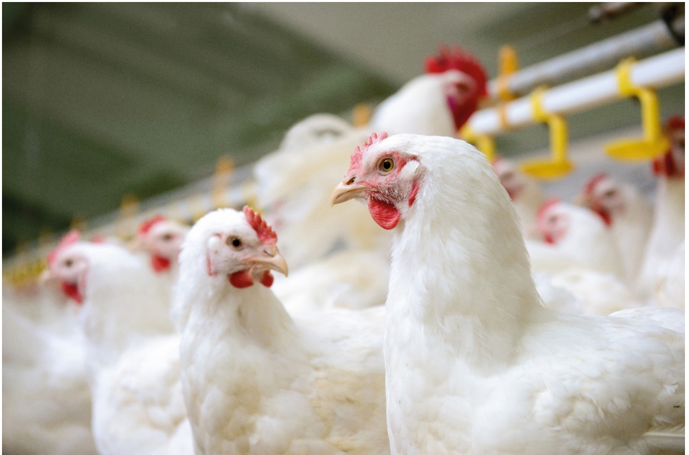
Mold growth reduces the nutritional value of feed, which affects animal health and performance

Excess moisture, high water activity, and high temperatures in feedstuffs are the main mold growth factors that concern the feed industry ( Mohapatra et al., 2017 ). At storage, grains' moisture content should not exceed 13%, and the water activity of raw materials, feedstuffs, and finished feed should be maintained below 0.8 ( Dijksterhuis et al., 2019 ). Controlling these points contributes to preventing the growth of most pathogens and undesirable microorganisms.