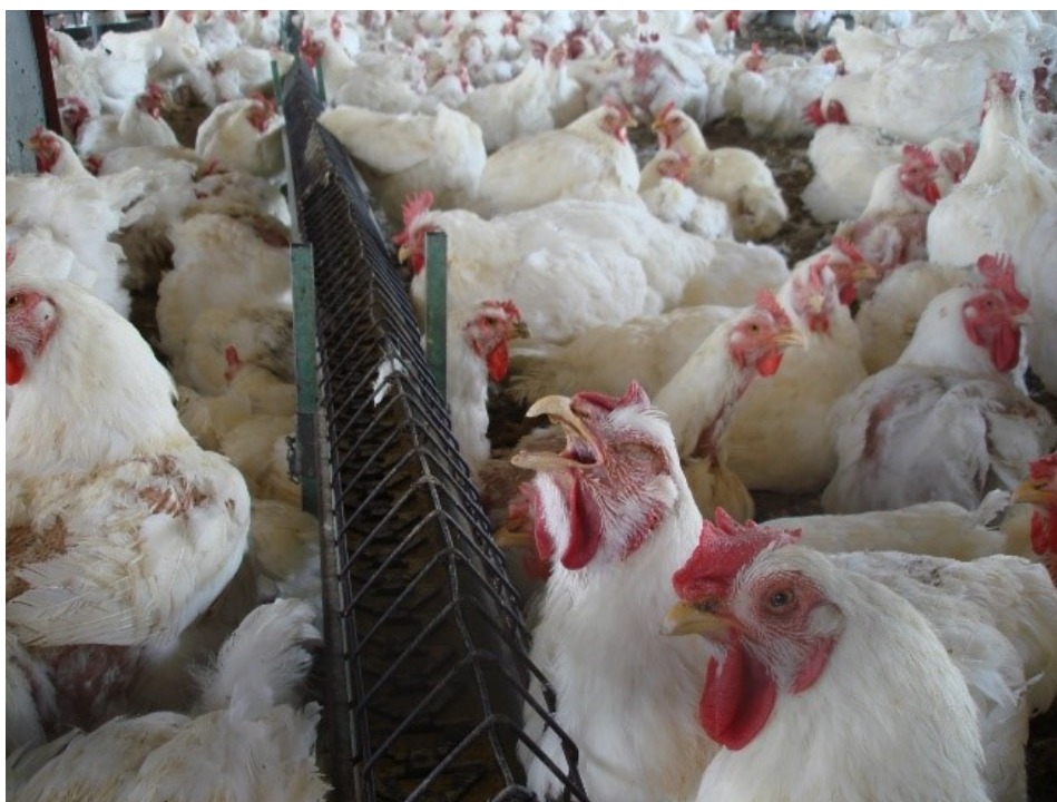
Clinical signs of respiratory disease in chickens include coughing, sneezing, and rales

In poultry production houses, especially in summer, high temperatures and low humidity increase the amount of air dust. Under such conditions, respiratory tract disorders in broiler chickens, including the deposition of particulates, become more frequent and more severe.