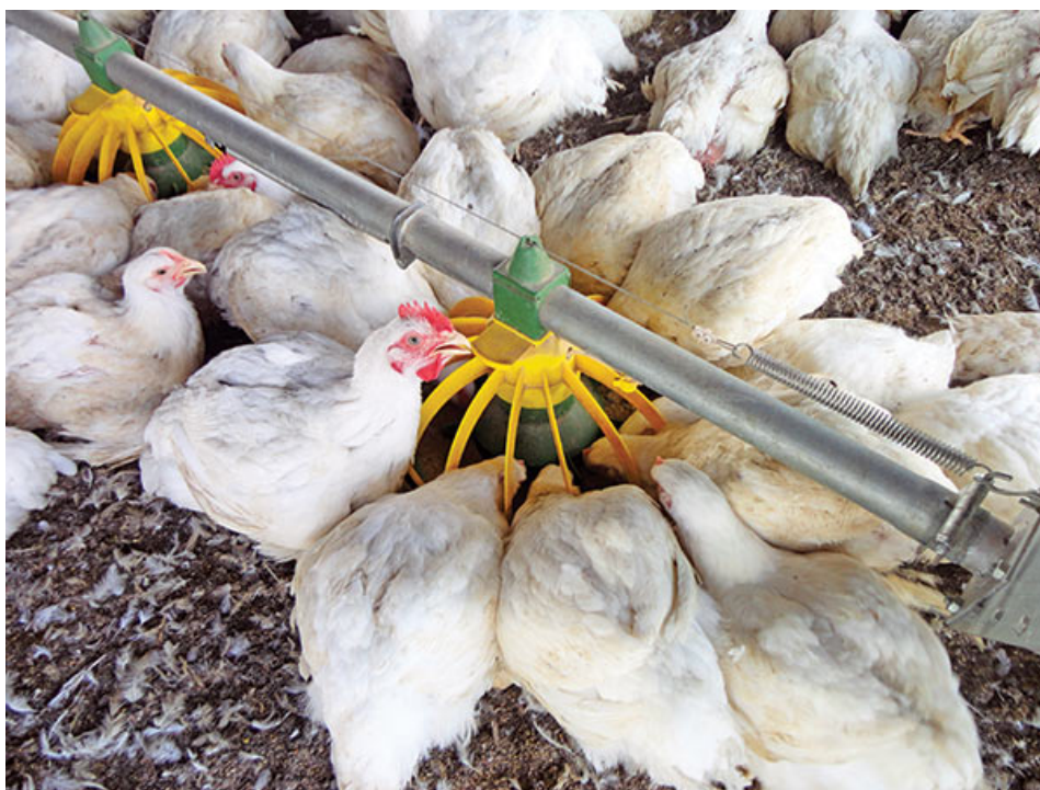
Several factors must be considered when using by-products in poultry nutrition

In summary, to use by-products in poultry diets, their cost, availability, nutritional composition, anti-nutritional factors, quality, as well as interaction and cost-effectiveness with feed additives (e.g., enzymes, toxin binders) must be considered to avoid or diminish the factors hindering animal health and performance.