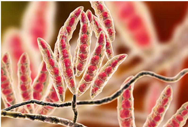
Fusarium ssp. produce mycotoxins such as fumonisins, trichothecenes (DON, T-2 toxin) or zearalenone

Most agricultural by-products have a higher moisture content than traditional ingredients. High-fiber and high-moisture materials can quickly become contaminated by molds that produce mycotoxins, undermining animal performance or even leading to death (Juan et al., 2017; Peng et al., 2018).