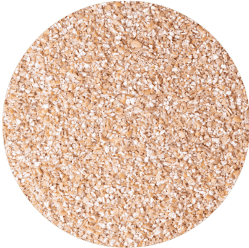
Wheat milling by-product