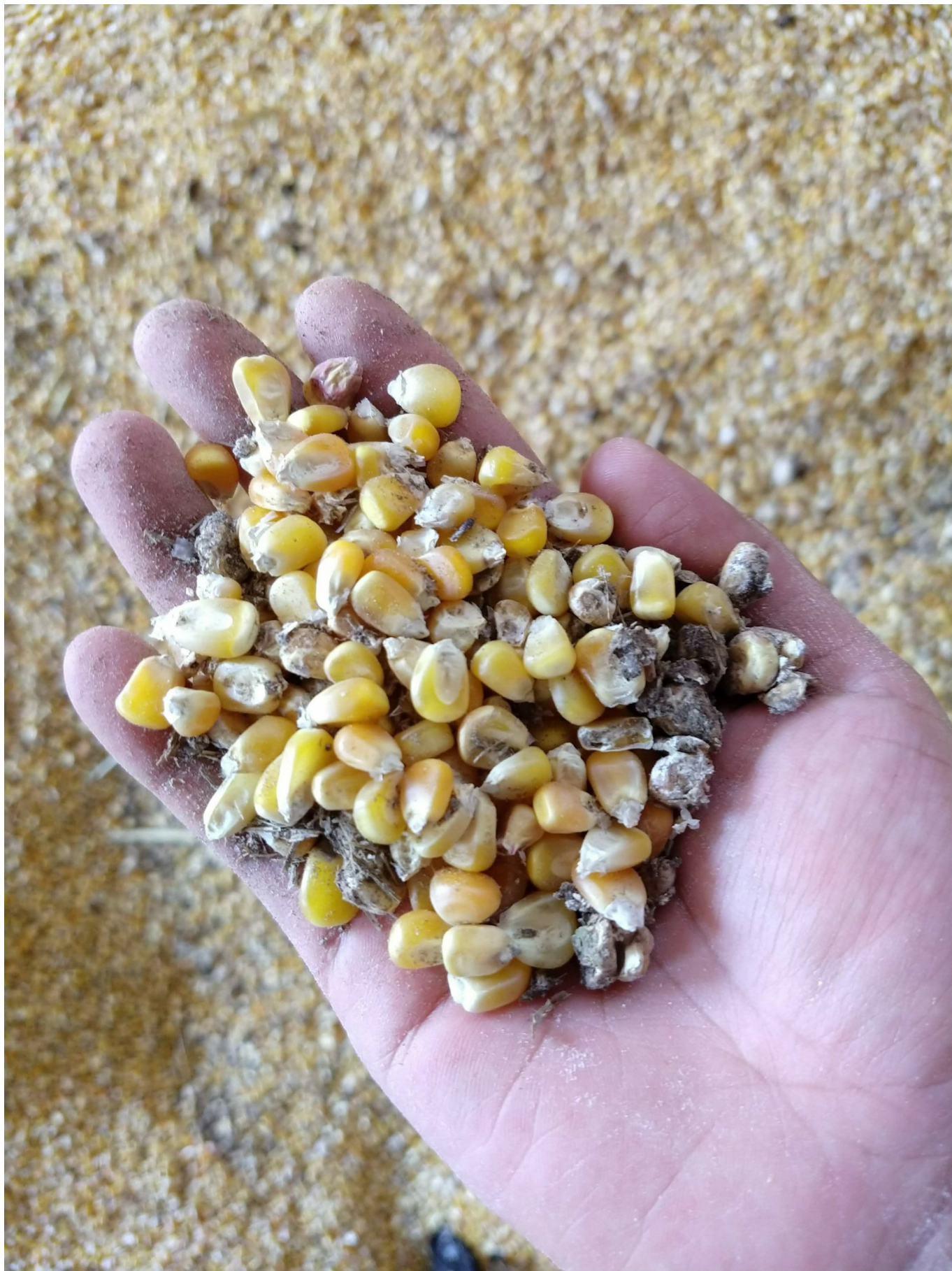
Organic acids help preserve animal feed and prevent spoilage through molds, yeasts, and mycotoxins