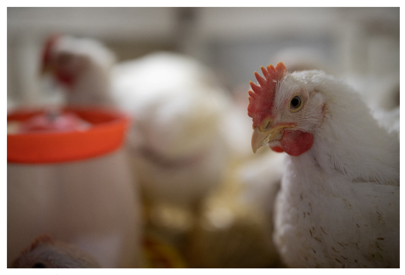
By T.J. Gaydos

Control of Necrotic Enteritis (NE) can be one of the most difficult challenges in a system without the availability of antibiotics. In addition, NE is a costly disease because of mortality and loss of performance. Necrotic enteritis is a multifactorial disease that requires damage to the intestinal mucosa, disruption of the intestinal microflora, and a toxin-producing strain of Clostridium perfringens. If any one of these three items is removed or lessened, the severity or incidence of NE will be reduced.