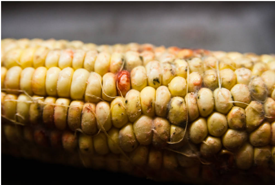
Microbial contamination by toxigenic molds threaten human and animal health

Agricultural production costs are and will be increasing further because climate change effects entail water scarcity, raw material shortages, higher energy prices, and stiffer competition for land as certain areas become climatically unsuitable for production.