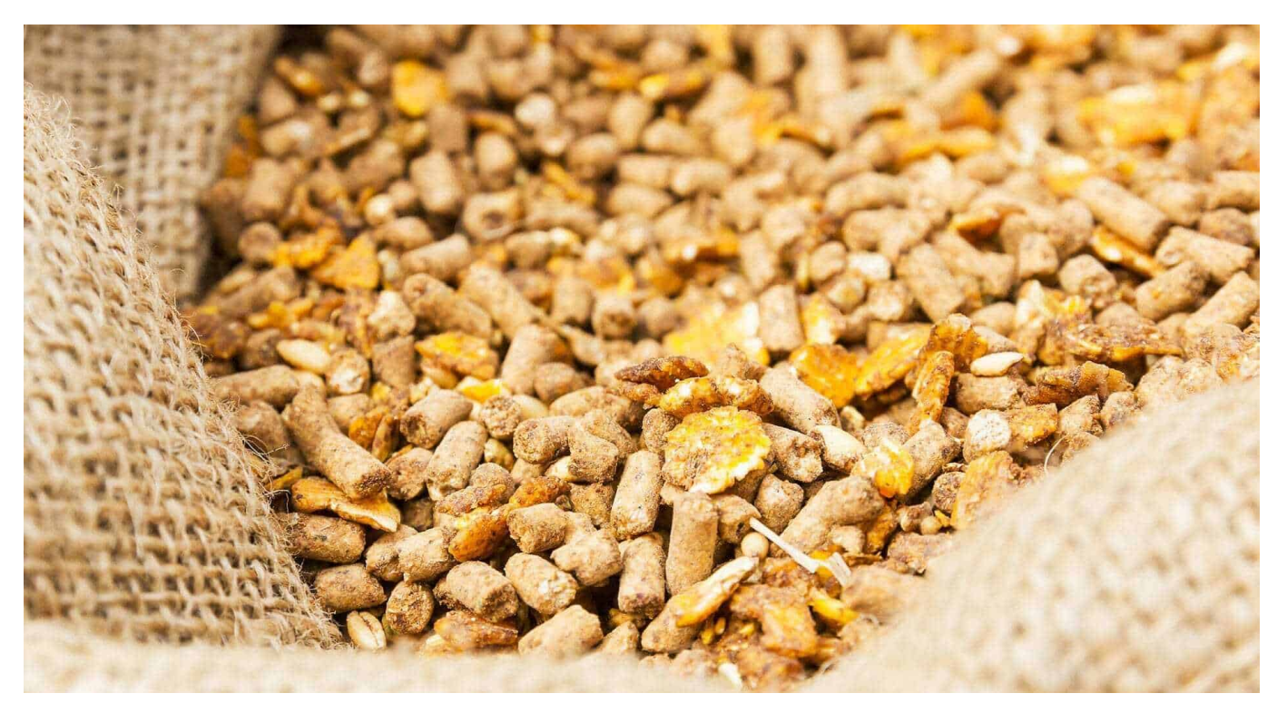
By Marisabel Caballero, Global Technical Manager Poultry, EW Nutrition

More than five months after the start of the war in Ukraine, we are facing severe challenges in many aspects of our daily lives. The livestock industry is not excepted: the conflict affects the availability and prices of grains, fertilizers, oil, and biofuel, with the latter two having a direct impact on freight rate and shipping time.