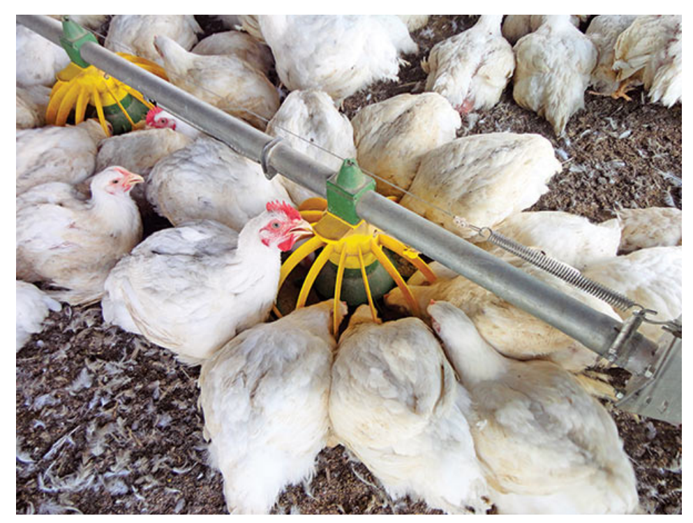
Several factors must be considered when using by-products in poultry nutrition

In summary, to use by-products in poultry diets, their cost, availability, nutritional composition, antinutritional factors, quality, as well as interaction and cost-effectiveness with feed additives (e.g., enzymes, toxin binders) must be considered to avoid or diminish the factors hindering animal health and performance.