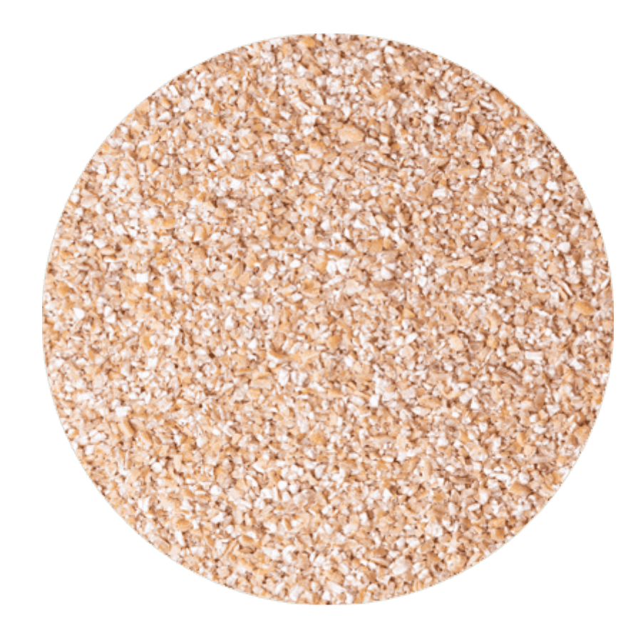
Wheat milling by-product