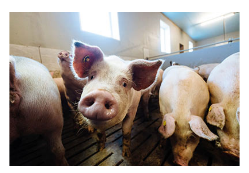
Pigs are susceptible to antinutritional factors

When by-products are fed to pigs, swine nutritionists have reported that many of them can support pig growth and finishing performance and meat quality as well as immune response, milk yield, and milk quality in reproductive animals, among other productive parameters (Yang et al., 2021). For instance, Dong et al. (2019) concluded that, from a nutritional perspective, ingredients such as highland barley, buckwheat, glutinous broomcorn millet, non-glutinous broomcorn millet, and Chinese naked oat could potentially substitute corn in livestock feeding. Or as another example, Liu et al. (2019) suggest in their study that mulberry leaf can contribute to improvements in meat quality, with no adverse effects on the growth performance of finishing pigs. (Dong et al., 2019).