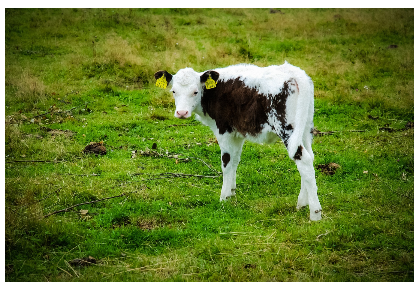
By Dr. Inge Heinzl, Editor, EW Nutrition

Diarrhea causes a higher workload, increased costs for treatment, losses, and, of course, lower benefits for the farmer. But not all diarrheas are equal. How do they differ, where do differences come from, and what can you do to protect your animals?