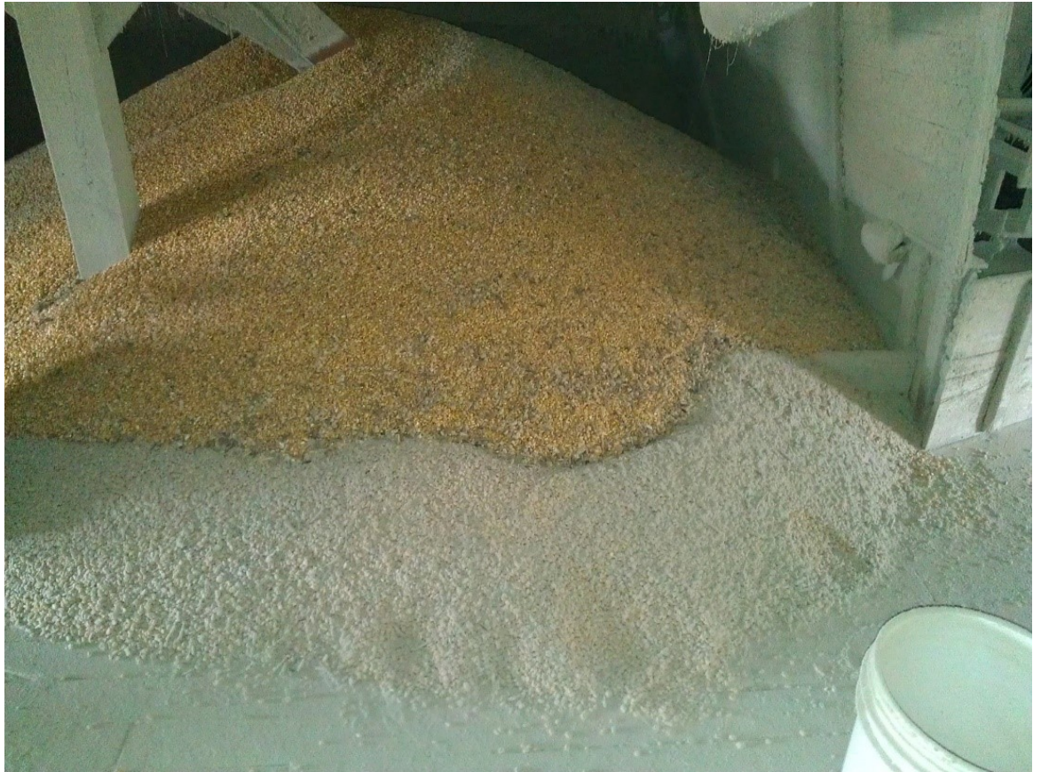
Figure 1. Grain storage in a home pig farm