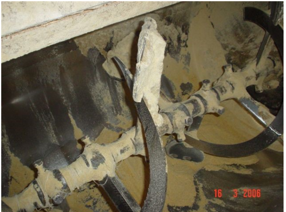
Figure 2. Feed mixer in a home mixer pig farm