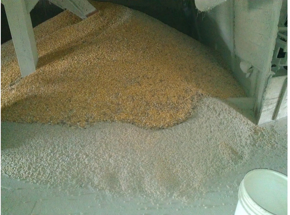
Figure 1. Grain storage in a home pig farm