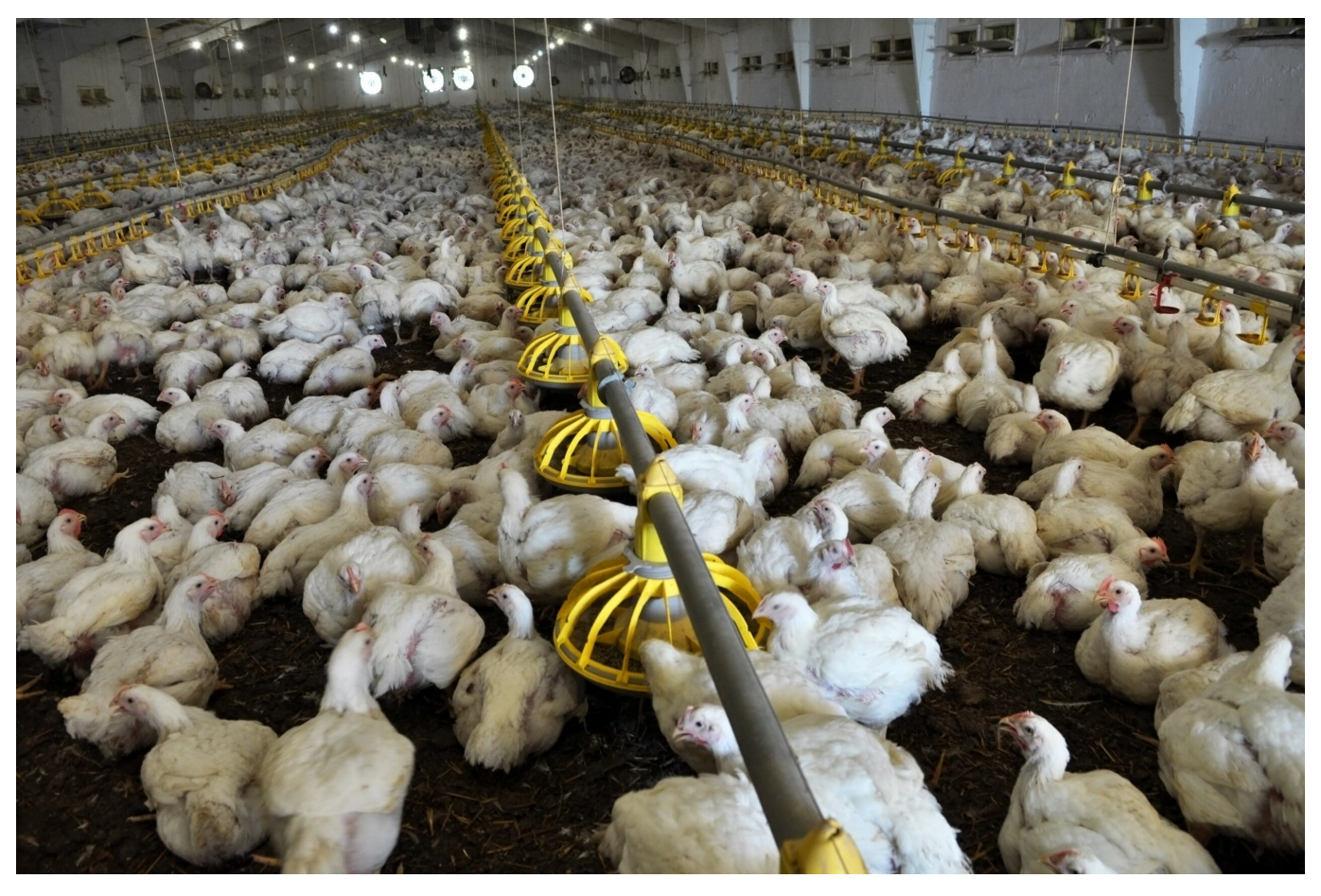
Meticulous coccidiosis management in ABF productions is crucial to safeguard animal welfare and performance.