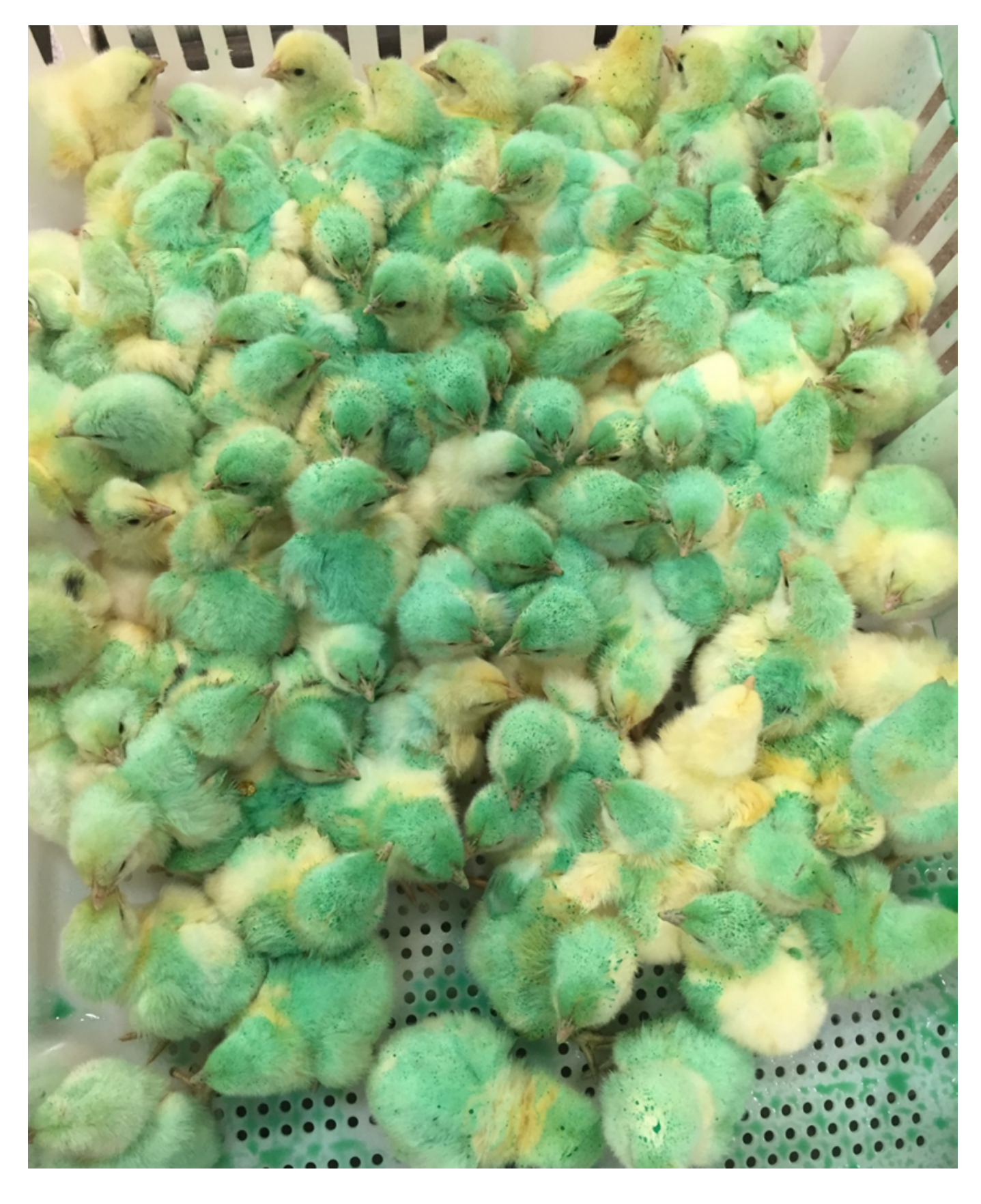
A dye helps to evaluate if the coccidiosis vaccine was evenly sprayed across all chicks.